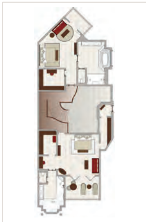
Royal Suite - First Floor