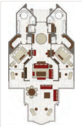
Crystal Rock Suite, Coin de Mire Suite, Gabriel Island Suite